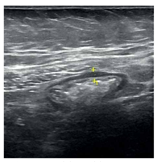
Figure 2. Intestinal ultrasound showing BWT = 5 mm in ascending colon in an IBD patient

The presence of disease activity is suggested in most patients by the combination of changed colour Doppler signal (CDS) and gut wall thickening. The benefit of this objective combination is that it offers excellent operator reliability [38]. The overall sensitivity of IUS varied from 54 to 93% when evaluating bowel affection, with a specificity of 97–100% [39], in comparison to our results, with sensitivity 64–74% and specificity of 79–82%. Doppler parameters could predict the response to the biologic therapy in IBD patients. This